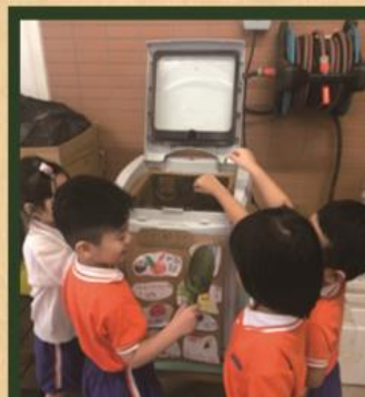
回收廚餘活動 Food waste recycling activity

學校邀請家長義工協助進行校外環保參觀活動。 The school invited parent volunteers to assist in conducting environment-related visits.