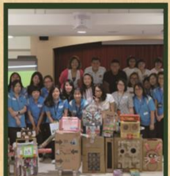
教職員環保培訓工作坊 Staff environmental training workshop